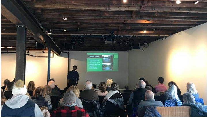
A capacity crowd started off the year with the SVBR CE Class, Flood Maps and Plains. Look for more great classes coming up in 2019!